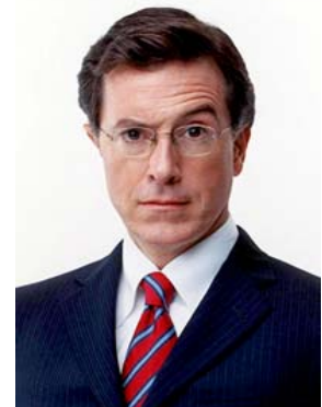
Stephen Colbert Comedian Philosophy Major

Those who have majored in philosophy at UMSL are now—among other things—professors, physicians, contractors, information systems specialists, pilots, attorneys, statisticians, entrepreneurs, organizational presidents and a host of other professionals.