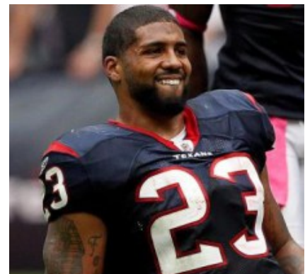
Arian Foster Houston Texans Philosophy Major

Those who major in philosophy as an undergraduate are often admitted to graduate programs in other fields, because admissions committees understand how well-prepared philosophy students are.