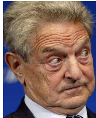
George Soros Investor Philosophy Major

Majoring in philosophy may not be the quickest path to wealth. But it is a good path for lifelong happiness. These salary averages are for people with no academic degree beyond the Bachelor's degree. But can majoring in philosophy help you if you choose to go to graduate or professional school instead?