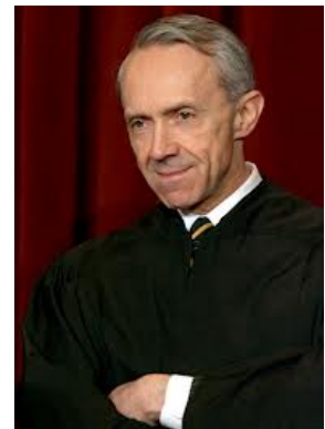
David Souter Associate Supreme Court Justice Philosophy Major