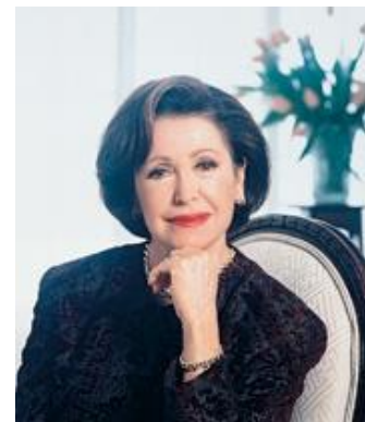
Mary Higgins Clark Novelist Philosophy Major

These last two points are connected. Because the kinds of issues philosophers focus upon are so abstract and important, it becomes necessary to think in a very logical and hard-headed manner in order to gain any intellectual traction that may lead to progress. You don't learn how to think well by studying the easy stuff.