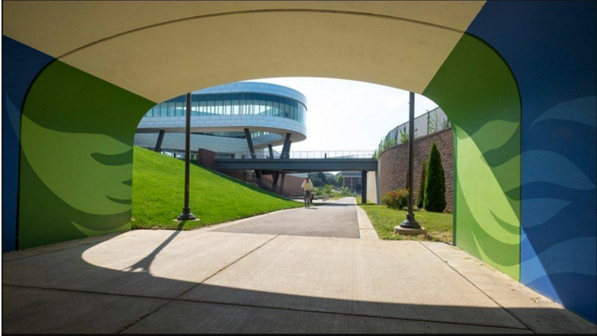
A cyclist rides along the St. Vincent Greenway and Wayne Goode Trail, past the Recreation and Wellness Center, and toward the tunnel passing under Arnold B. Grobman Drive.