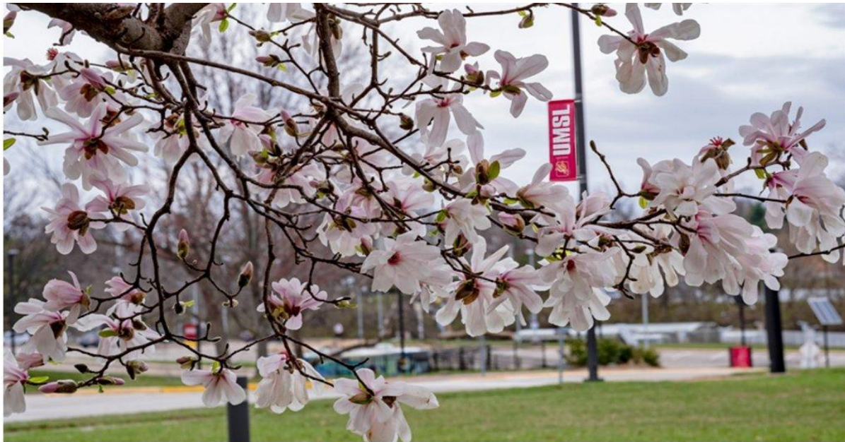
UMSL received the Arbor Day Foundation's Tree Campus Higher Education certification for the third straight year in recognition of its efforts to cultivate and maintain trees on campus.